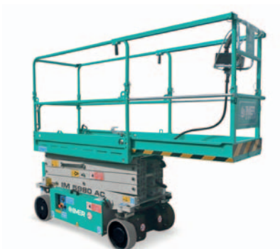
Manual deck extension 1 m