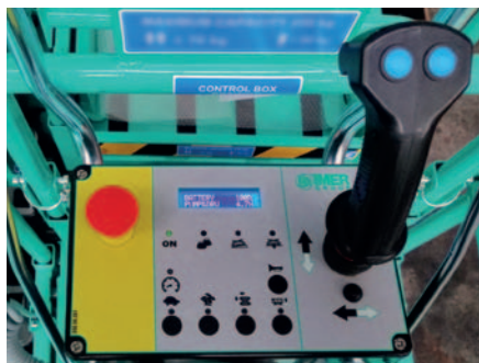
Control panel on the platform with capacitive buttons: simplicity and safety of use