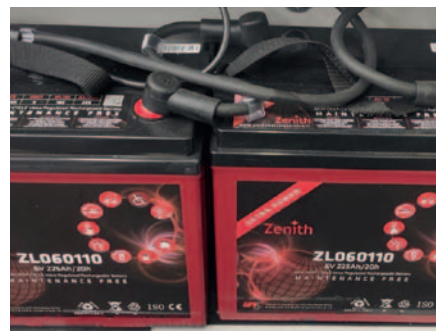
AGM batteries compartment