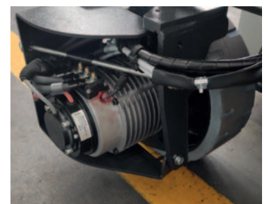
AC electric motor. 90° wheel steering.